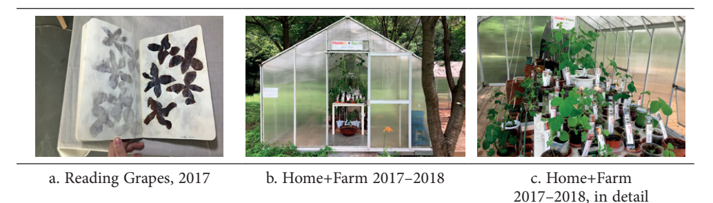
Table 7. Several of Soonim Kim's previous works

another of her recent projects that reflects her interest in life and food. The project involved planting roots and seeds that were left after the main parts of vegetables and fruits bought at markets were consumed. Then, she filmed these remains to determine how they put forth buds, sprouted leaves, and bore fruits again. At her first interview, Kim said that she was attracted to the main function of Science Cabin as a living laboratory operated by its unique renewable resource system. She valued the on-site experience, looking for challenges and possibilities that could emerged during her time spent living in an unfamiliar space in a science community.