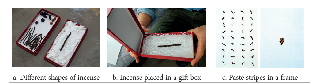
Table 6. The final outcomes of Lim's work

Kim (b. 1975) introduced herself as an artist who learns from local environments, creates works using local materials, and enjoys meeting local people. With interest in what she eats every day, every time she consumed grapes, she pasted the skin remains into a notebook as one writes a diary (Table 7a). The Growth Story of Home+Farm 2017–2018 (Table 7b, 7c) is