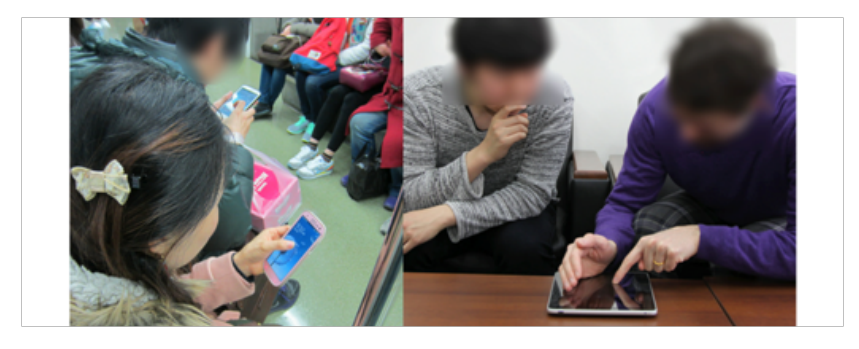
Figure 1 Two casual observation scenarios. On the left, a user authenticates with the Android Pattern Lock on a busy subway. On the right, a user conceals his password entry process from a colleague by cupping his hand over a tablet screen.

This weakness poses particular issues for what we term casual observers - the colleagues and peers who may accidentally learn passwords simply by failing to look away at the critical moment of entry. Given the growing and preferential use of tablets, mobiles and other pervasive devices in entertainment and collaborative work activities and indeed the physical sharing of such devices during these tasks (Rogers, 2009), we argue that is not always possible to maintain the Department of Homeland Security's recommended etiquette. Even without malicious motives, looking away is not as easy as it sounds and not knowing can become a chore. This is problematic as, beyond the fundamental security issues, conspicuously protecting passwords (such as cupping a hand around the input field, as in Figure 1, right) or inadvertently revealing or learning them can result in social discomfort, embarrassment or awkwardness (Sasse, 2011).